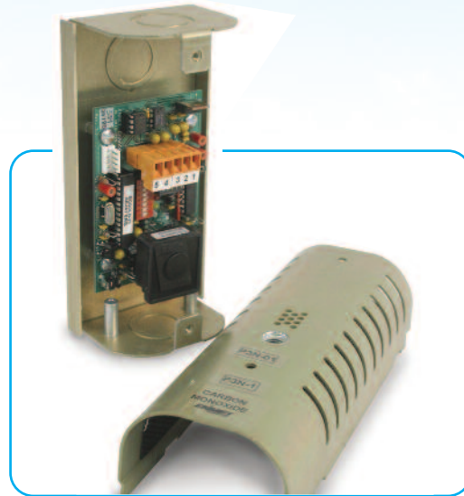
The EC-Gold offers easy plug-in wiring connects and a unique long life sensor.